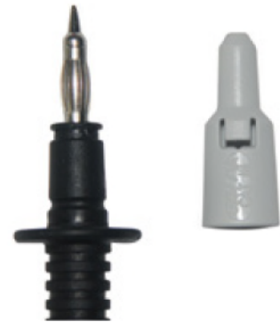
Test lines in accordance with EN-61010-031 CAT III Cap removable for CAT II environments