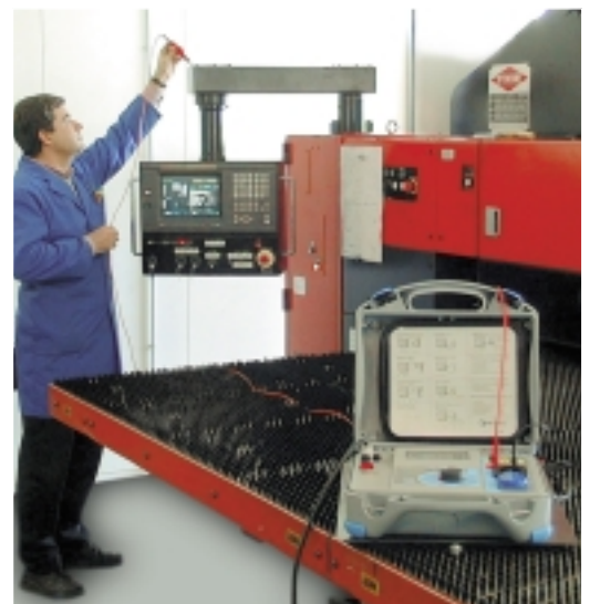
Complete testing of safety on machines (at initial installation or on periodic basis)

Automatic test: One-man operation by remote probe