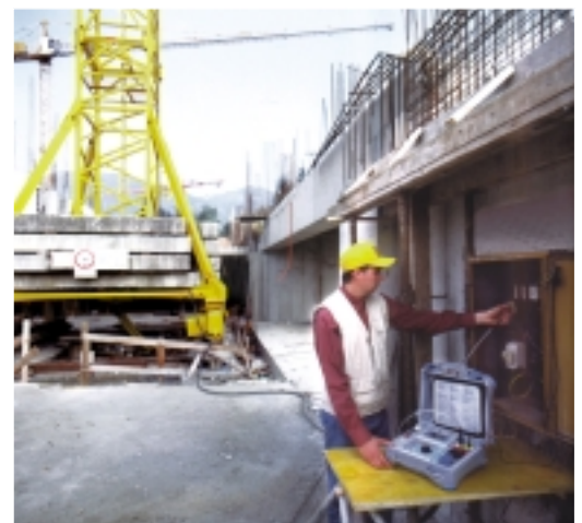
Testing of safety in a construction site on a switchgear