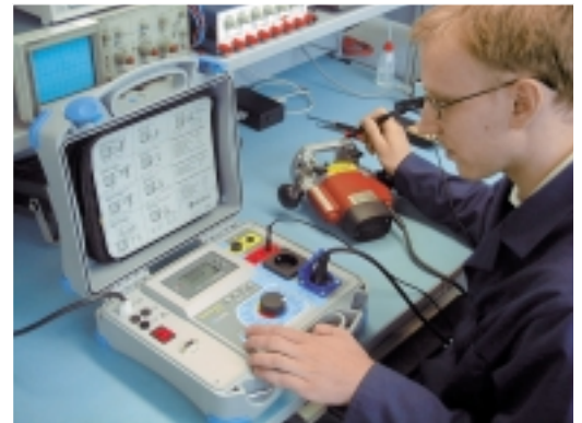
Final test on a portable appliance in a service workshop